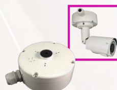
YUK-D06 Junction Box(option)

*No SD card slot & local storage function for Argentina