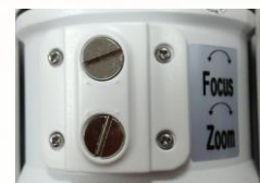
External zoom/Focus adjustment