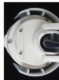
External SD card slot with cover (add rubber for waterproof)